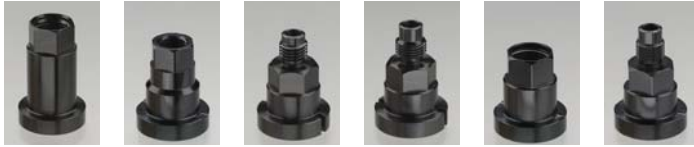
2A 4A 5A 6A 7A 8A