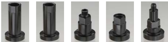
18A 19A 20A 21A 22A