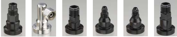
9A 10A 11A 12A 14A 15A